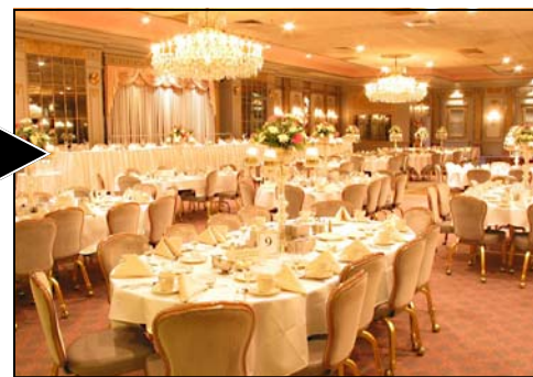
FRIDAY NIGHT GALA FUNDRAISER